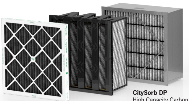
CityPleat Carbon MERV 8

One strategy to mitigate the risks of wildfire smoke is to utilize a combination of carbon filtration to control odor and gaseous contaminants and high efficiency air filters on PM2.5 particles.