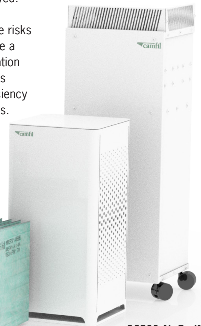
City M Air Purifier Includes 99.99% HEPA filter for particulate down to 0.3 micron and carbon filter for gaseous contaminants